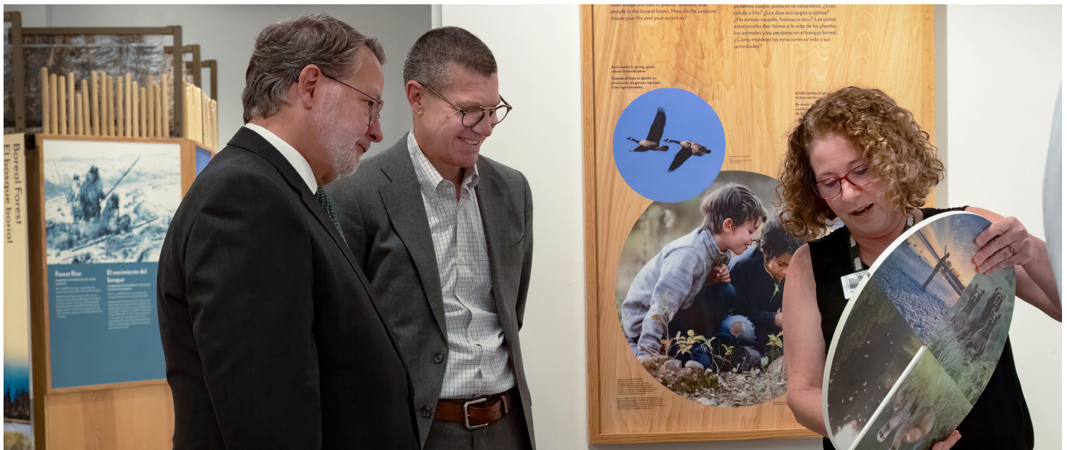
U.S. Senator Gary Peters visiting the “Knowing Nature: Stories of the Boreal Forest” exhibition

The MSU Museum achieved the honor of becoming Michigan’s inaugural Affiliate of the esteemed Smithsonian Institution in September 2001. Since then, we have collaborated on numerous joint initiatives aimed at advancing research, generating new knowledge, and enhancing public engagement. This Affiliate status provides the Museum opportunities to engage in collaborative endeavors with the Smithsonian and fellow Affiliates, fostering initiatives that benefit MSU and our state, as well as the Smithsonian national programs.