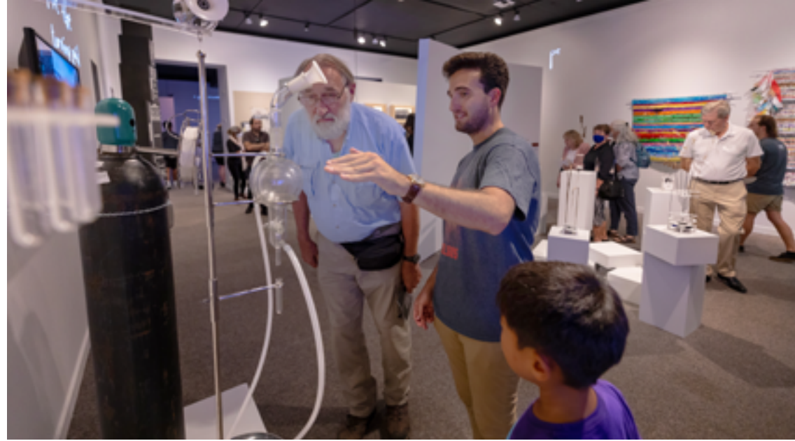
A CoLaborator facilitating a conversation in the 1.5° Celsius exhibition