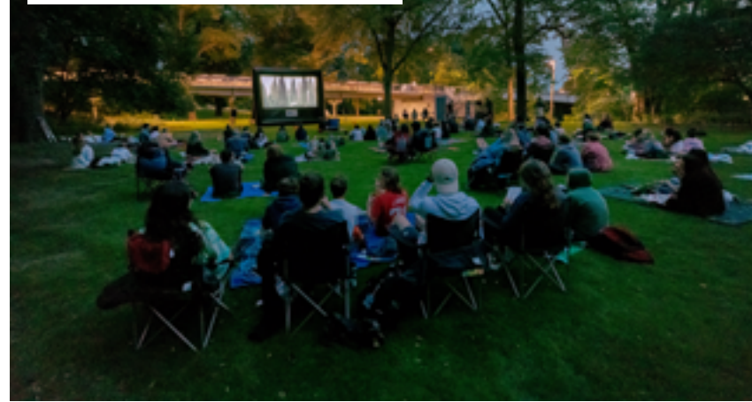
Film screening of WALL-E in the W.J. Beal Botanical Garden