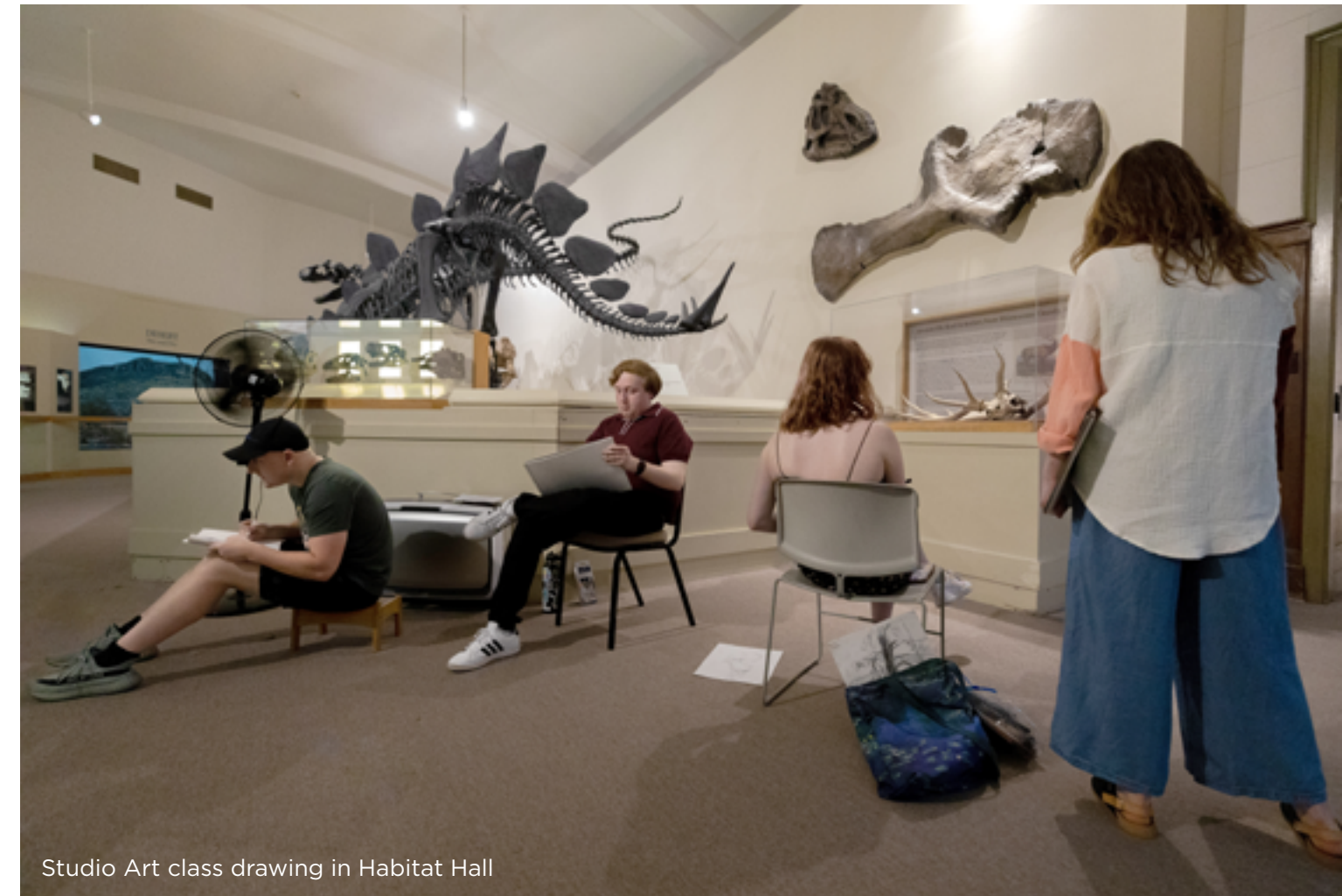
Studio Art class drawing in Habitat Hall

Additionally, the Museum serves as a vital "third place" for students to express their creativity and indulge their curiosity through extra-curricular activities. In the past year alone, the Museum organized over seventy-five timely and relevant public programs. Notably, our inaugural First Fridays program series for college students attracted an average of 150 attendees per event, successfully providing students with a space to build and foster social connections while engaging with the Museum's offerings.