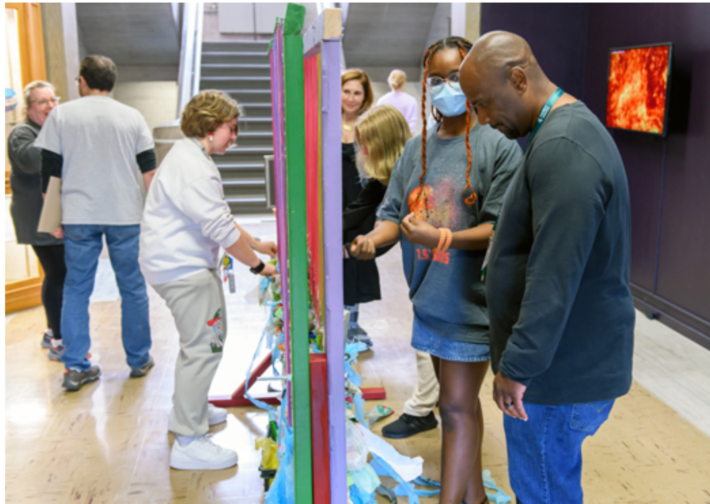
Community weaving with reused plastic

With a rich history spanning 165 years, the MSU Museum has been a valuable resource to the MSU community. However, recognizing the potential for greater influence, the Museum is undergoing a transformative shift from being a repository of knowledge to becoming a catalyst for enriched teaching, learning, and research. This metamorphosis positions the Museum as an innovative collaboratory, fostering creativity within the campus community and extending its impact beyond its boundaries.