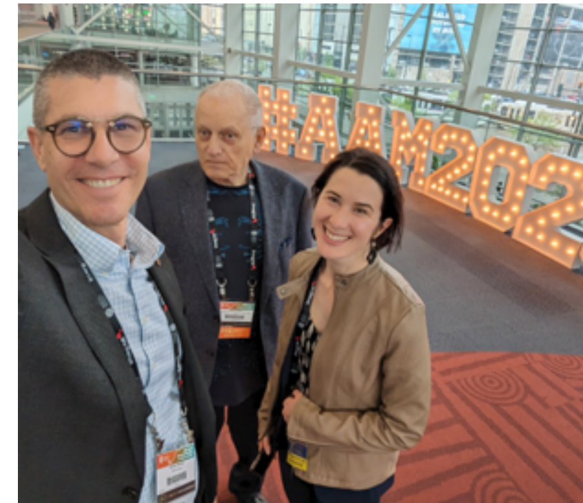
MSU Museum staff at the American Alliance of Museums annual conference