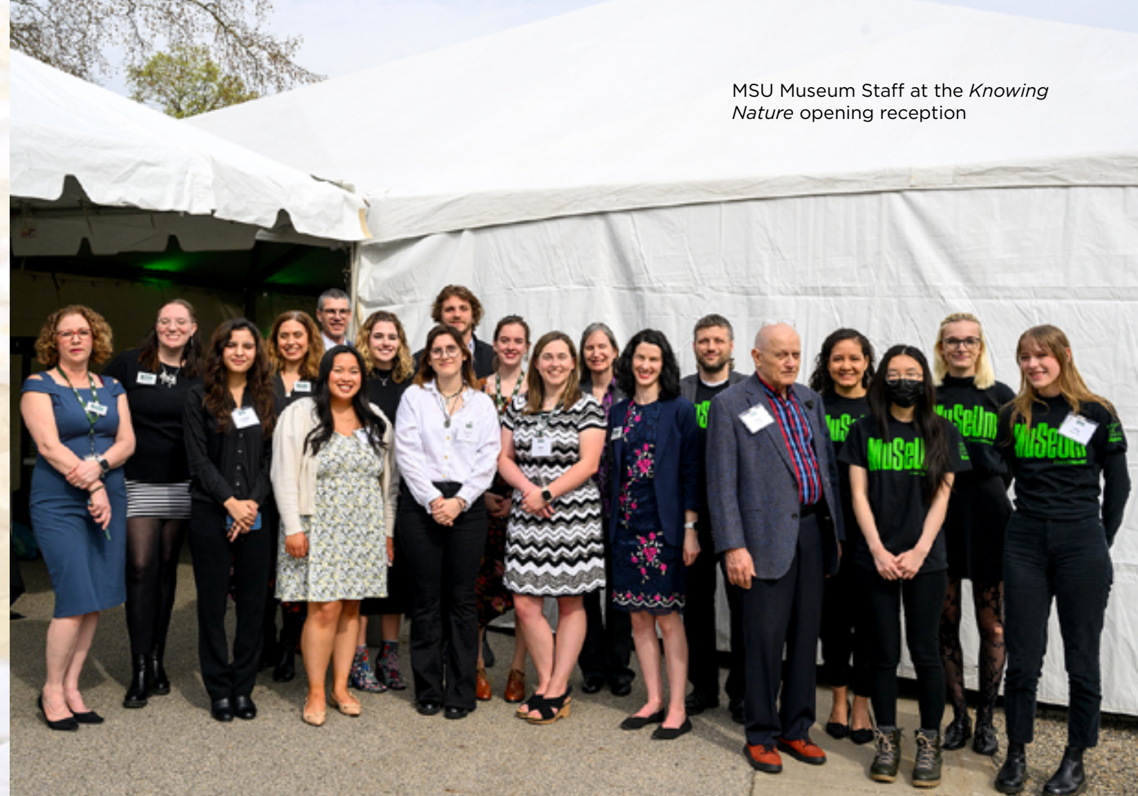
MSU Museum Staff at the Knowing Nature opening reception