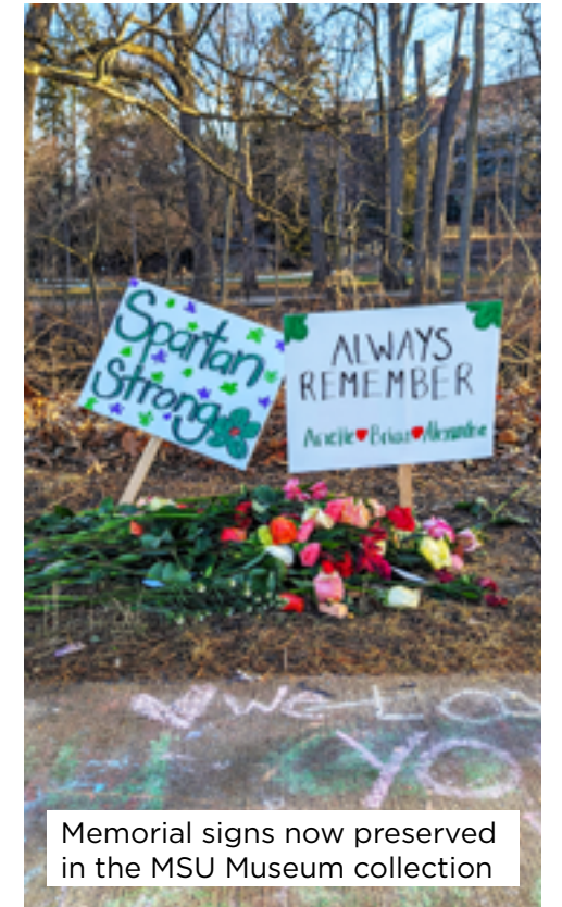
Memorial signs now preserved in the MSU Museum collection