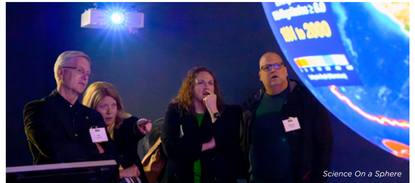
Science On a Sphere

In addition, the Museum staff collaborates intimately with faculty members to extend the impact of new research through carefully designed exhibitions and educational programming. This commitment includes supporting Broader Impacts — the potential societal benefits emanating from a research project — in relation to grants awarded by the National Science Foundation. Furthermore, the Museum staff work directly with faculty to generate and distribute geophysical, environmental, and cultural data visualizations through the innovative Science On a Sphere (SOS) platform, which features a six-foot diameter immersive visualization display. Additionally, the SOS system was utilized for teaching, with over 500 students creating custom content for the system during classes.