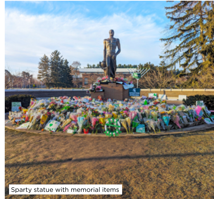
Spartan statue with memorial items