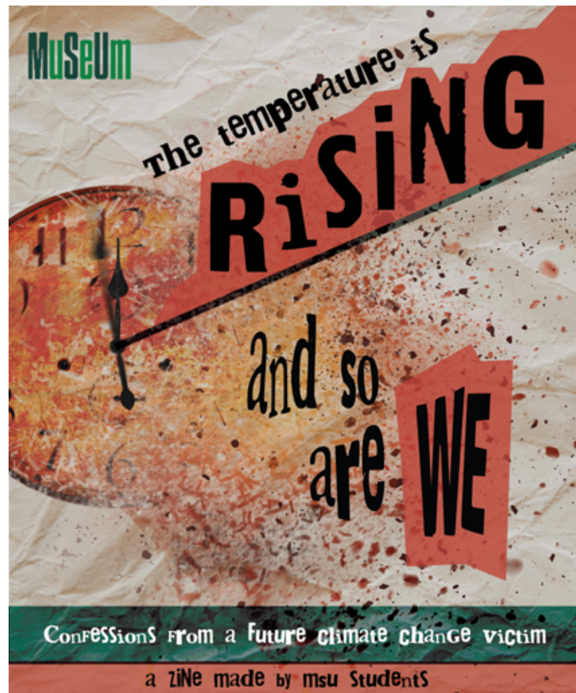
Front cover of the zine produced by the CoLaborators

In the spring 2023 semester, the CoLab successfully orchestrated a timely and responsive exhibition and program series focusing on the societal ramifications of artificial intelligence (AI) generative models. Titled Prompt Response: Exploring Generative Artificial Intelligence , this initiative delved into the cutting-edge advancements within emergent AI technology, notably highlighting OpenAI's DALL-E 2 and ChatGPT. These innovative AI models have stirred significant discourse surrounding the ethical and professional considerations associated with generative models in creative domains. By examining these latest developments, the CoLab shed light on the intricate implications and challenges posed by AI generative models on society.